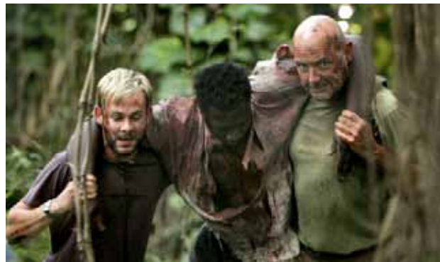
Ex student Dominic Monaghan in 'Lost'

A strong grounding in the central expertise and knowledge-base of a particular sector specialism.