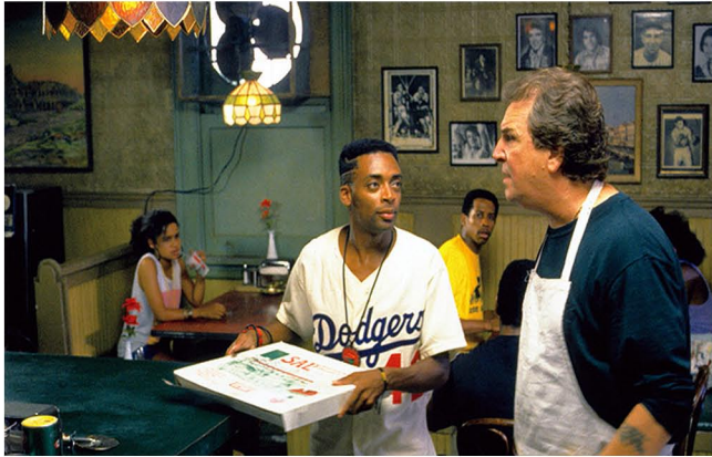
Do The Right Thing

Films that will form the basis of textual analysis will range from the historical to the contemporary including; 28 Days Later , Fight Club , Collateral , Road to Perdition and The Godfather .