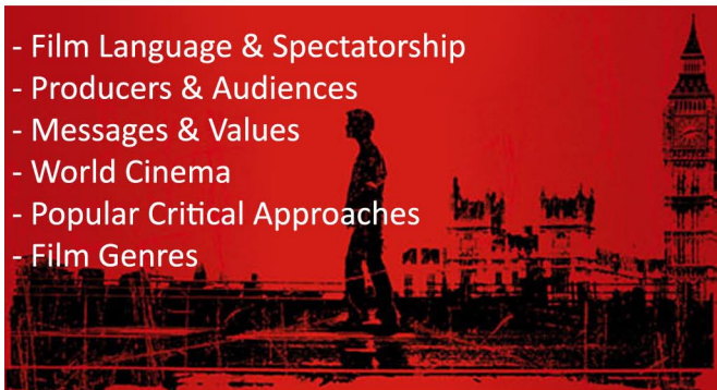
28 Days Later