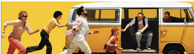
Little Miss Sunshine

Excellent library (LRC) resources with a diverse range of books, magazines and journals.