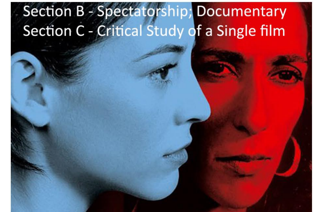
Talk To Her